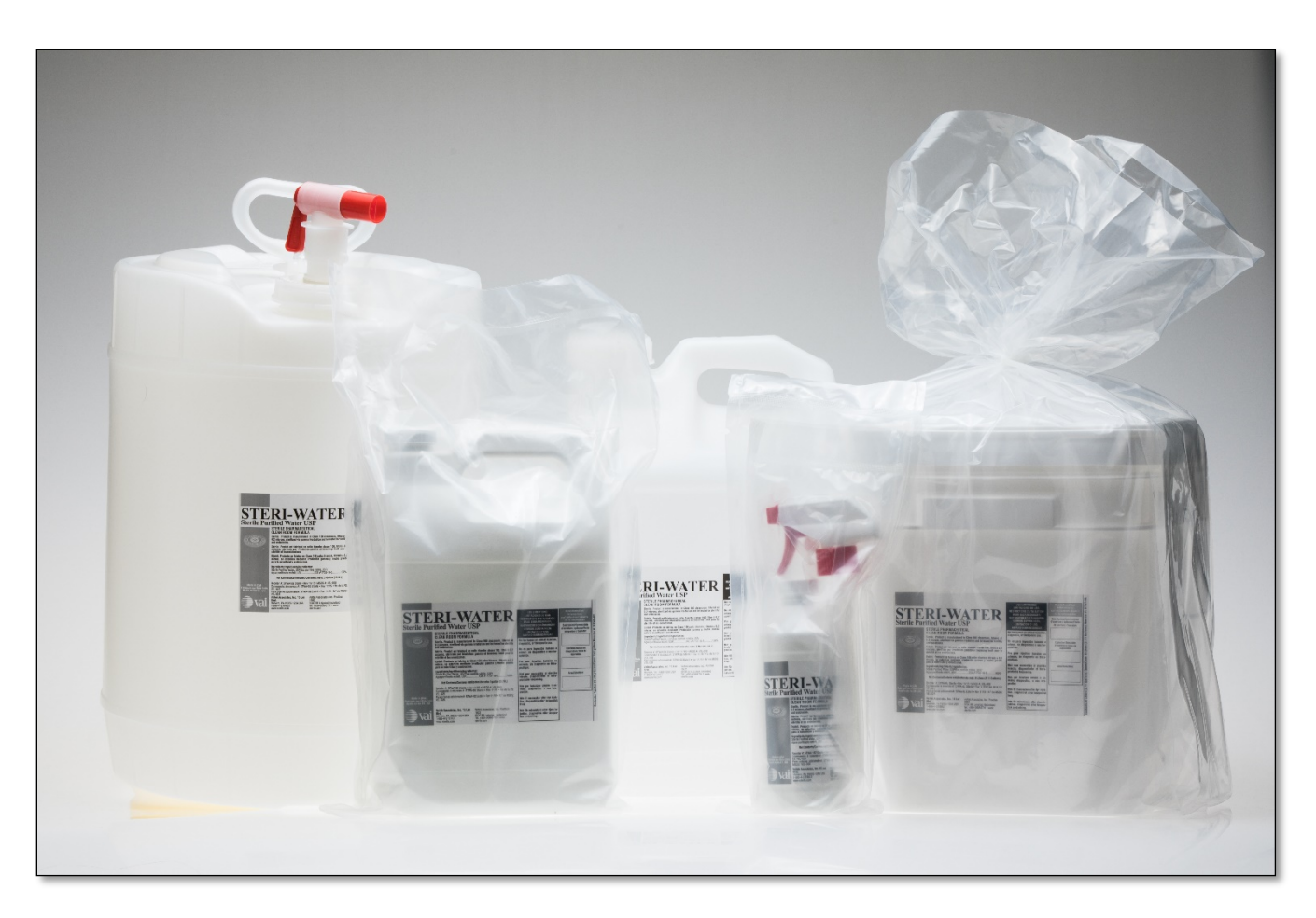
STERI-WATER Family of Products

(Any specific product label is available upon request.)