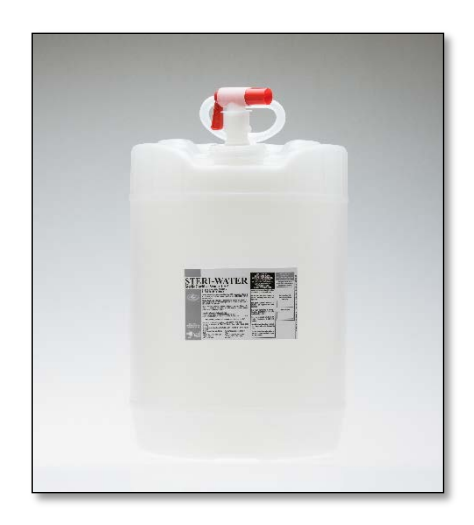
STWA-5G with Faucet

The ABCD Cleanroom Introduction System is a packaging system that allows operators/users to take the package through each level of classified areas by simply removing one bag at a time. Each bag acts as barrier protecting the finished product from becoming a carrier of viable and non-viable contamination. This prevents the need to decontaminate each outer bag prior to entering a cleaner area. In this packaging system, sterilized groups of containers are contained in two outer bags and after each are removed individual containers are each additionally contained in two easy tear bags.