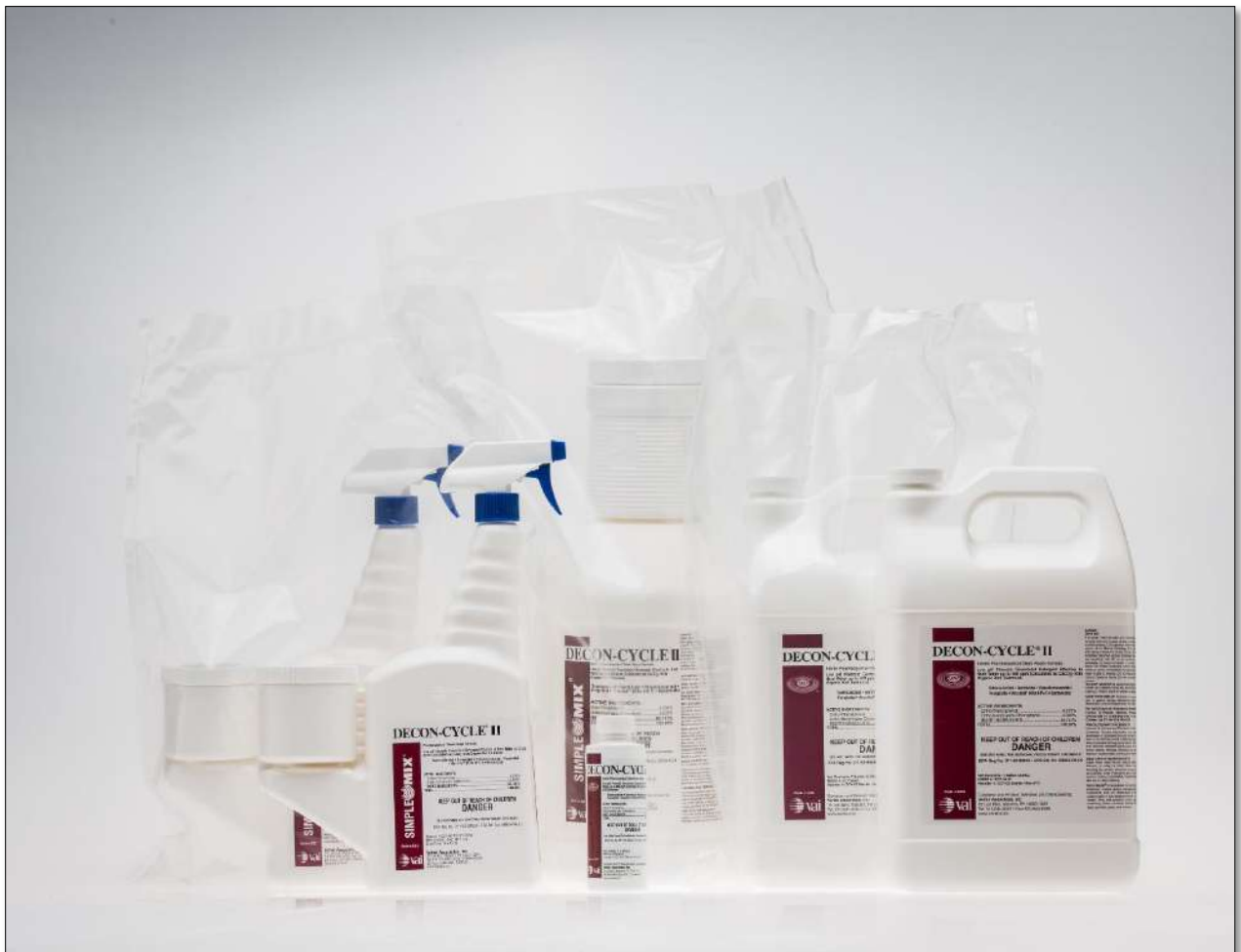
DECON-CYCLE II Family of Products

(Any specific product label is available upon request.)